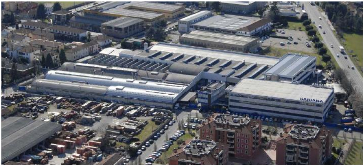
Aerial view of Sabiana headquarter

Sabiana 2 and 3: via Virgilio 2, 20013 Magenta (MI), Italy